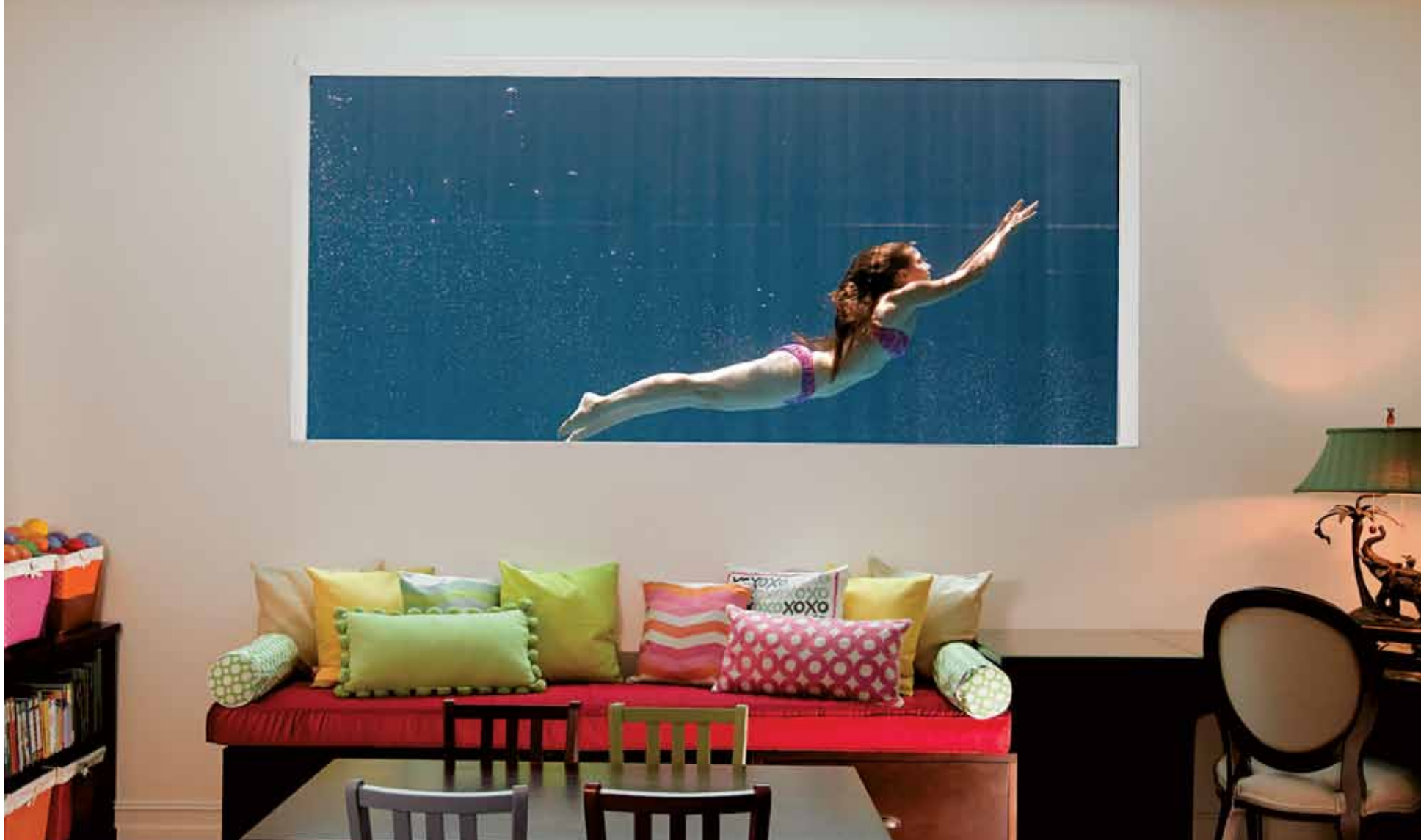
ABOVE Swimming in the infinity pool, the view from downstairs children's play room