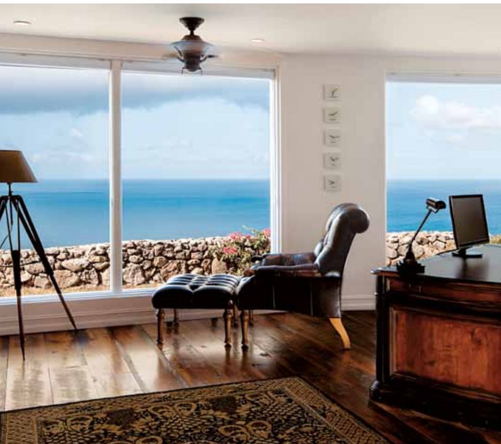
ABOVE Endless view of the Caribbean is the backdrop when business calls at SeaforMiles

spaces designed to suit their lifestyle and love for entertaining.”